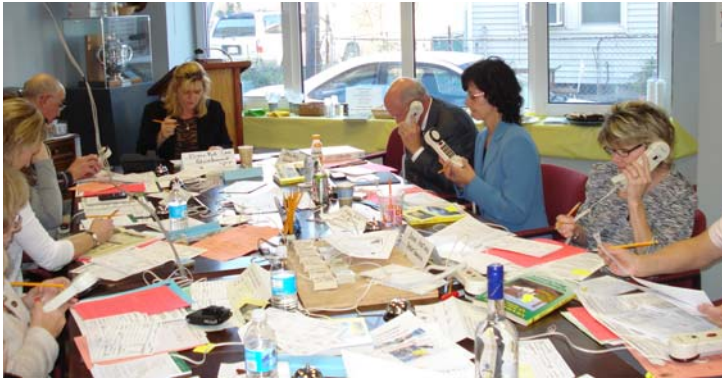
Volunteers called businesses throughout the Cape Ann and North Shore regions, inviting them to join the Chamber.