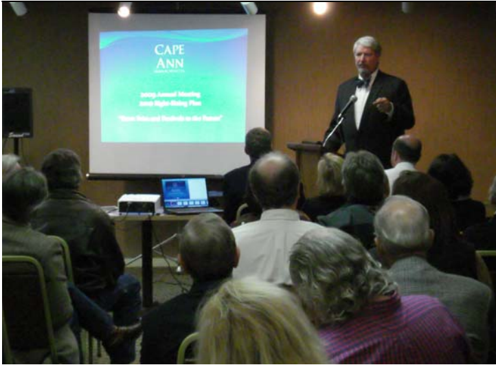
The Chamber's Annual Business Meeting at Rockport Inn & Suites was well-attended. Attendees were given an overview of the past year and a sneak preview of the year ahead.