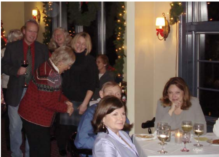
Holiday receptions were held in the four Cape Ann communities for friends and members of the Chamber, including the Lucky 9 Raffle Drawing shown here at The Landing at Seven Central in Manchester.