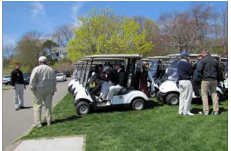
Beautiful blue skies greeted the golfers at the annual Business/Education Collaborative Golf Tournament at the Bass Rocks Golf Club on Monday, May 2. (see story and more pictures on page 3)

We've gotten rave reviews, thank you to everyone who has called or emailed about the new guide. Copies are available at the Chamber offices. Thank you to all of our advertisers for your support.