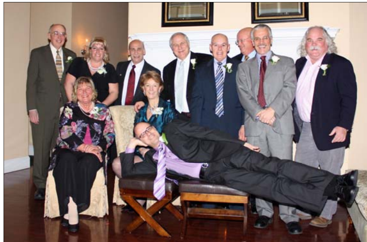
The Chamber Past Presidents had a great time at the 2011 Annual Dinner Dance.