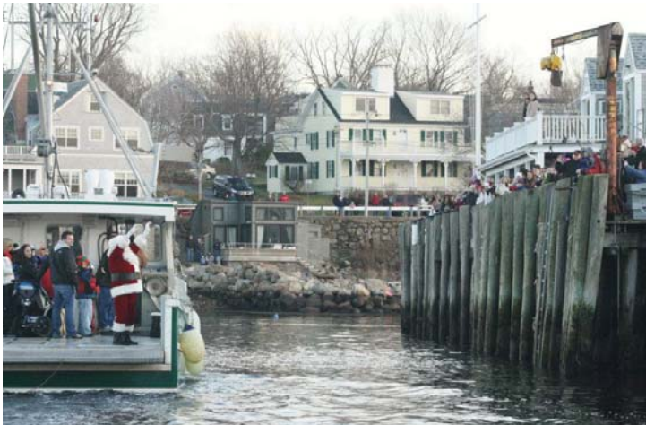
Santa greeting people in Rockport.