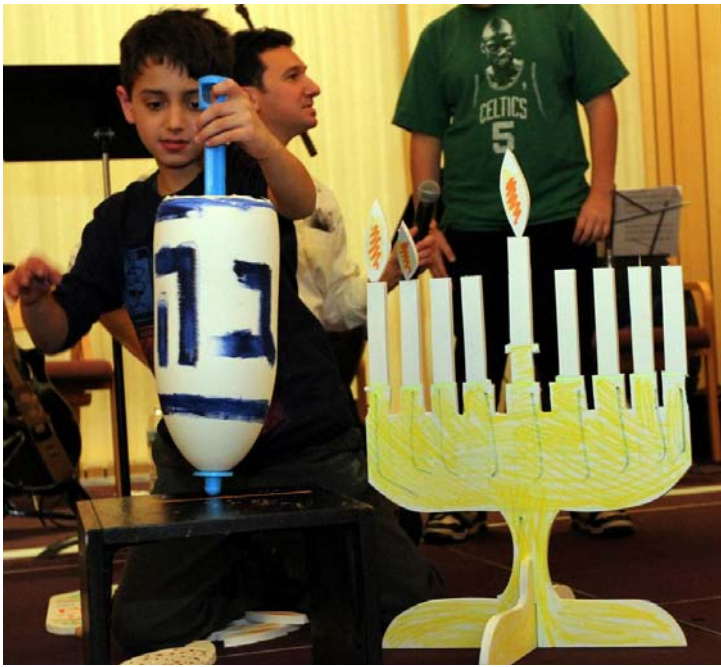
First night of Hanukkah at Temple Ahavat Achim.