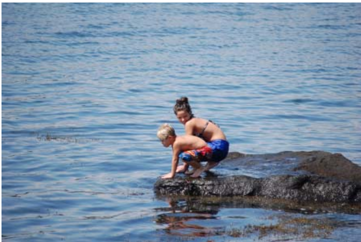
Magnolia Beach Rocks by Susie Mosse