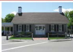
37 King Street, Rockport, MA 01966