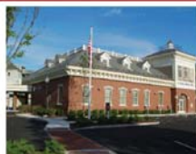
4 Parker Street, Gloucester, MA 01930

Serving the Cape Ann Community Since 1851