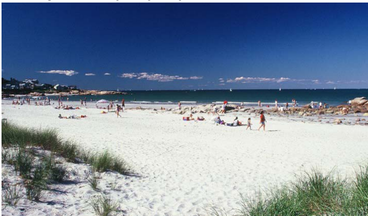
Wingersheek Beach