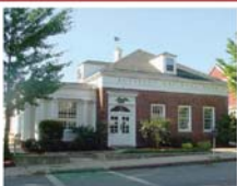
16 Main Street, Rockport, MA 01966