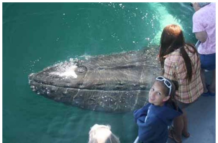
Whale Watching by 7 Seas Whale Watch