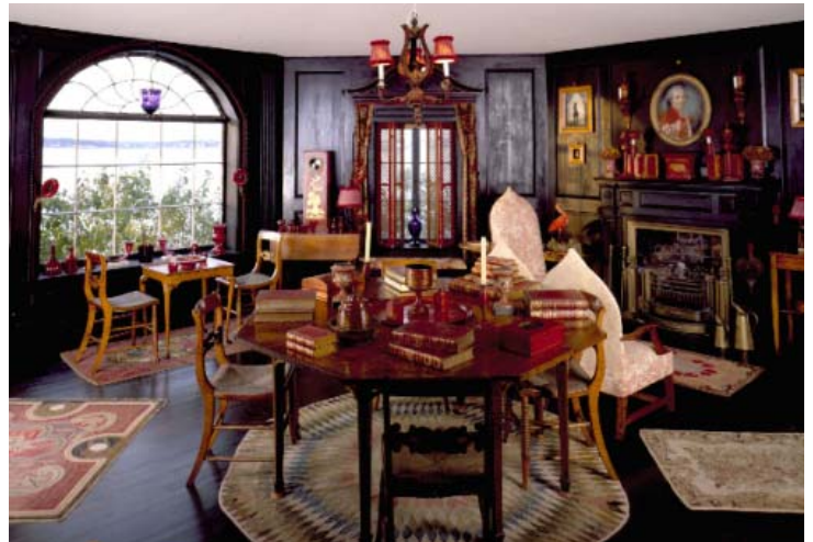
Beautiful museums by Beauport, Sleeper McCann House