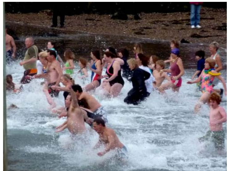
Take a swim with a friend.