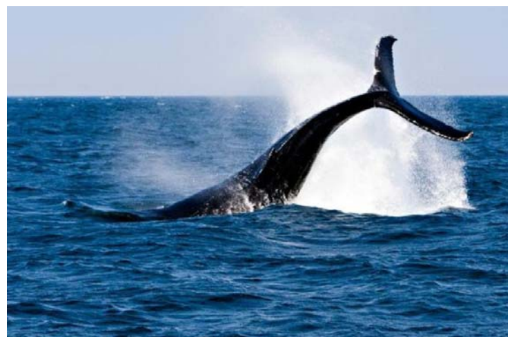
Whale Watching by Captain Bill & Sons Whale Watch