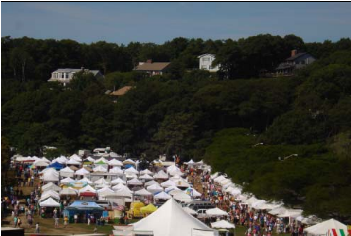
Spectacular weather and beautiful crafts welcomed more than 25,000 guests to the Gloucester Waterfront Festival in August. Thank you to the many volunteers that contributed to the success of this great weekend.