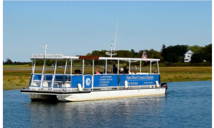
Take a river cruise.